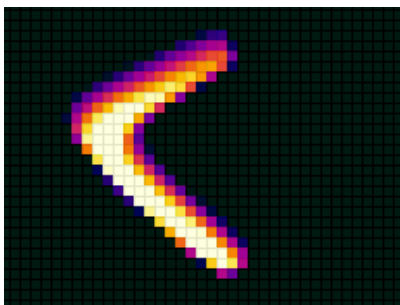
Figure 2: Good plastic weld